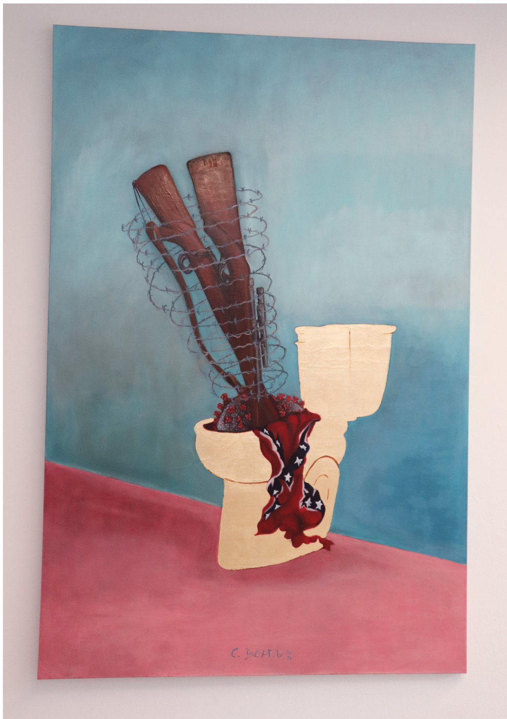
Still Life, Flushing the Toilet Egg tempera and oil on canvas 72x46 inches Cristina Beard