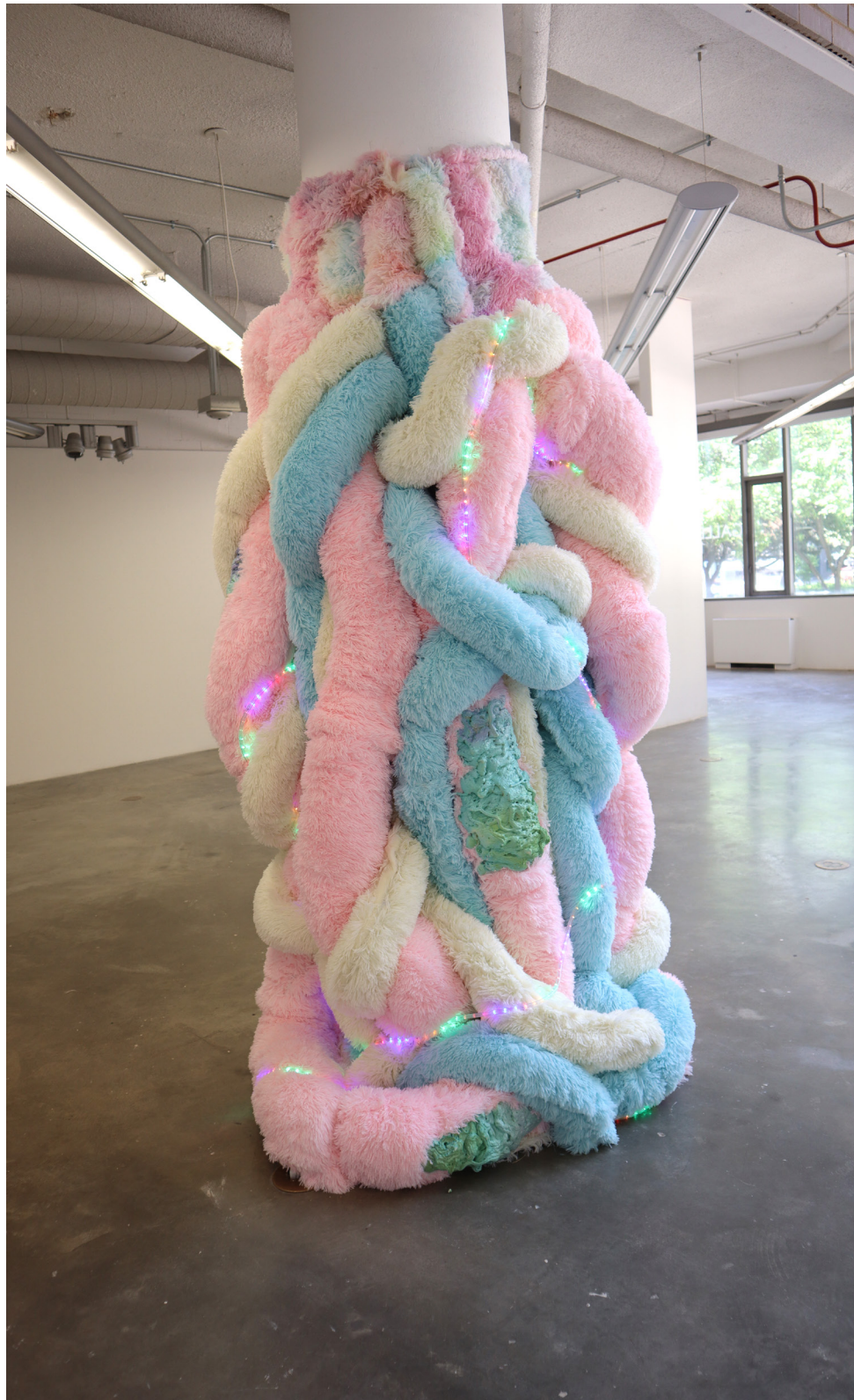
Fabric of Life: Recovery Nod Shag fabric, steel wire, aluminum foil, fishing wire, compression rope, chicken wire, magnets, spray foam insulation, and spray paint 10 ft x 6 ft Emmye