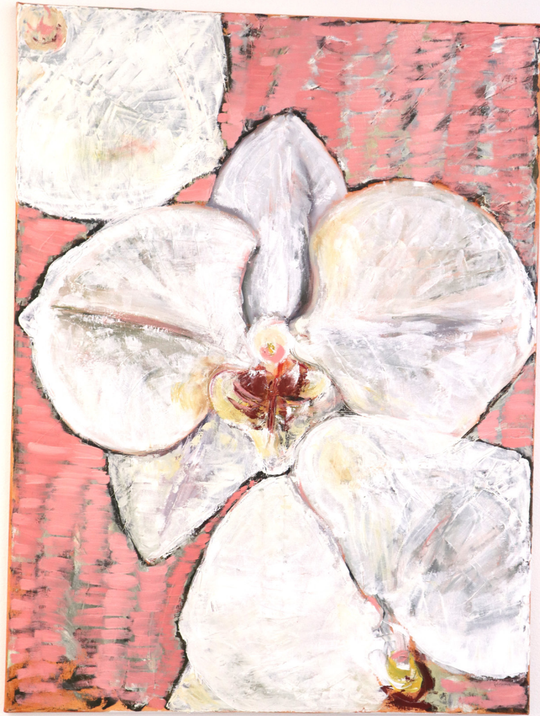
Resilience Oil on canvas 48 x 36 inches Cristina Beard