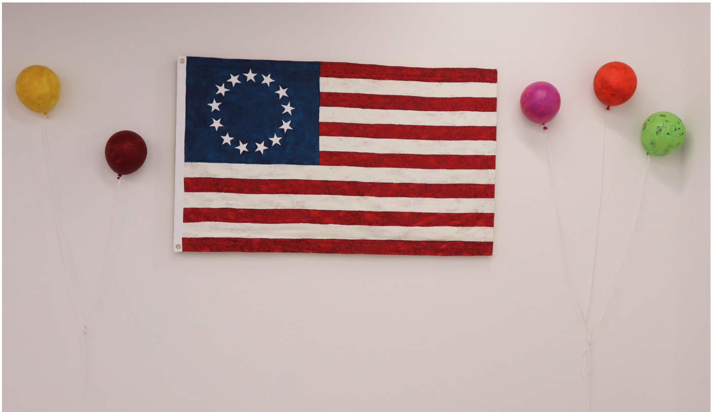
Remade in America Acrylic and oil paint 3x5 nylon flog (made in China) and balloons Prati