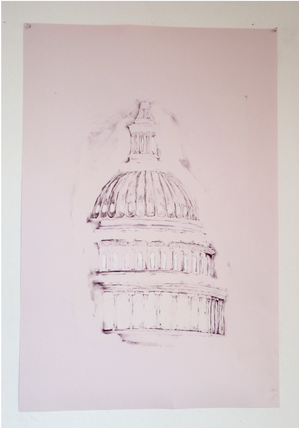
Capitol Digital Painting 24x36 Allie Collier