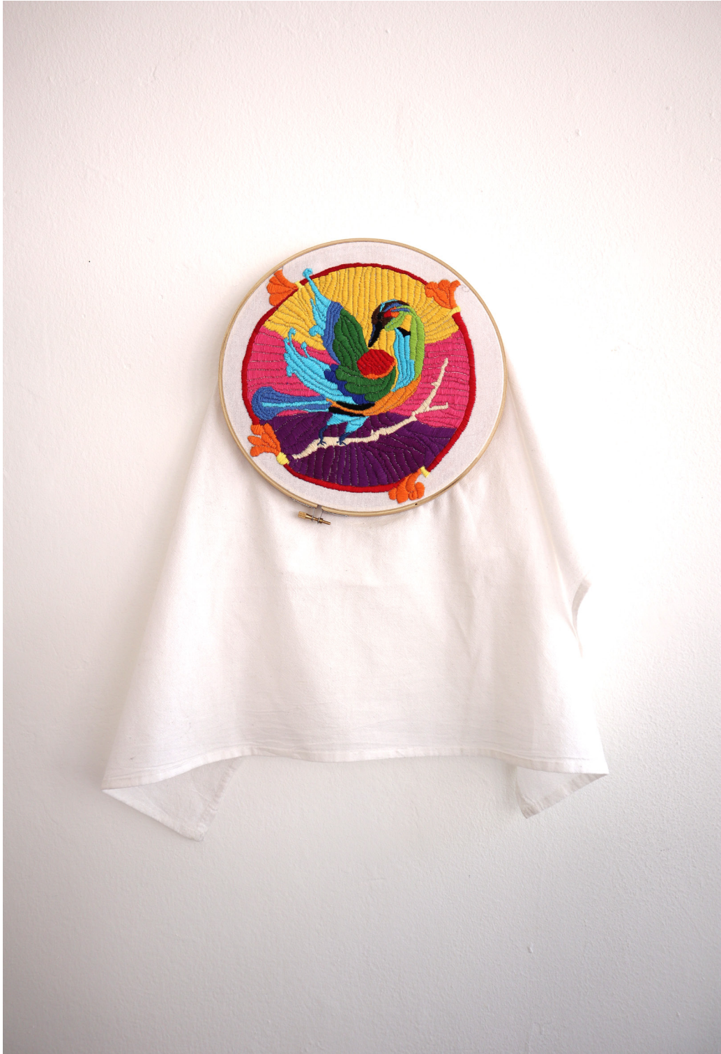
Fair Trade Embroidery 10 inches Cristina Beard