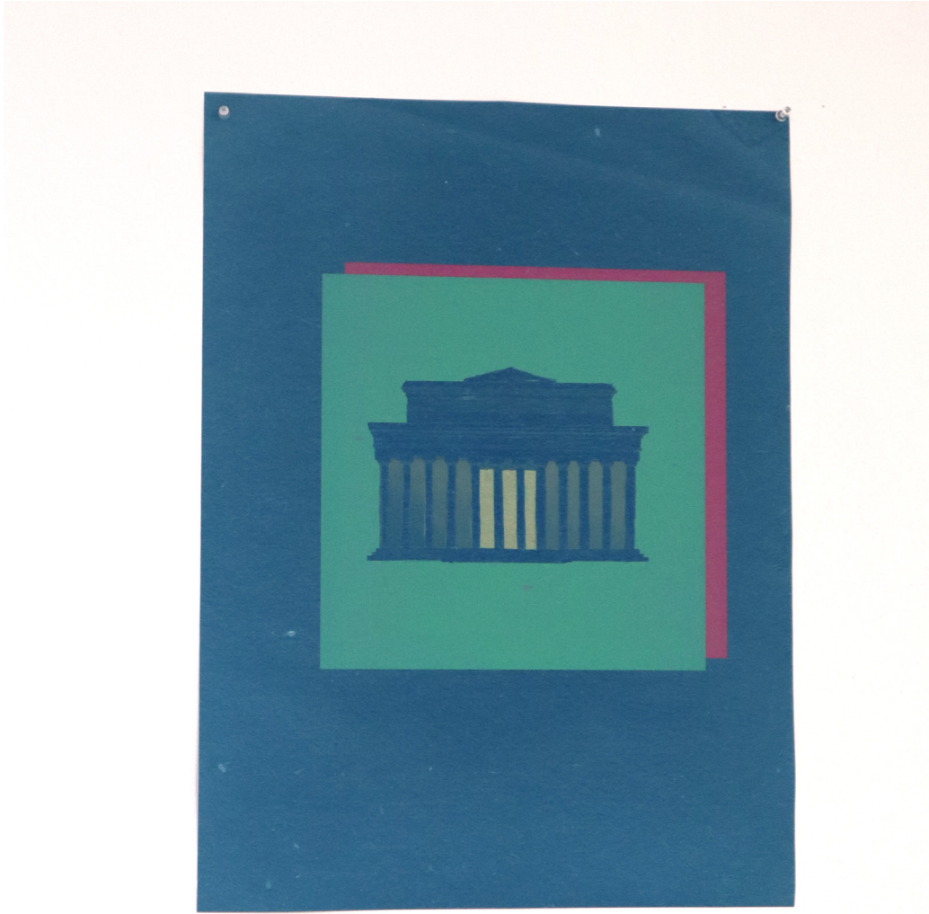
by night Digital Painting 18x24 Allie Collier