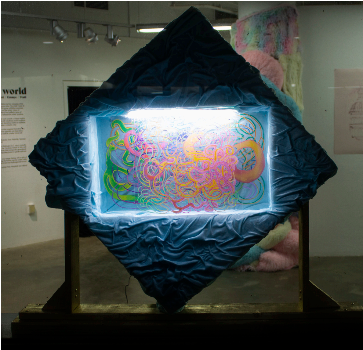
Sequelae Triad 3 Foam, basswood, plywood, steel, LEDs, plexiglass, fabric, and POSCA pens Emmye