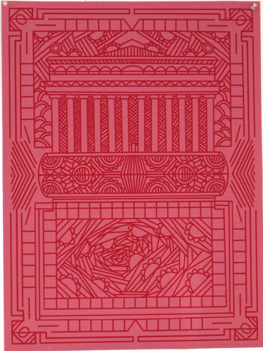
rosy Illustration 18x24 Allie Collier