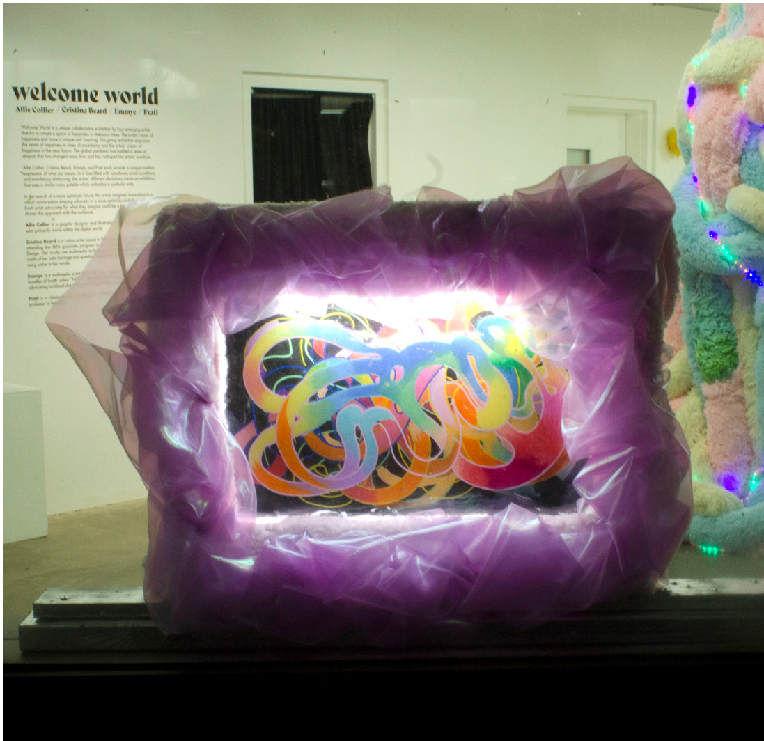
Sequelae Triad 2 Foam, basswood, plywood, steel, LEDs, plexiglass, fabric, and POSCA pens Emmye